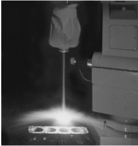
Figure 2. Plasma gun mounted on the ROTAPLASMA® 500 rotating device spraying a cylinder.

prior works showed that the required value can be reached up to a thickness of more than 300 \mu\text{m} (Wuest et al. , 1997).